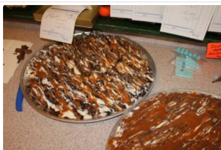
Donating to the Northport Rotary benefit at Oheka Castle