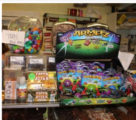
More popular toys

Sweeties Candy Cottage is located at 142 East Main Street, Huntington, NY 11743. Call (631) 423-7625