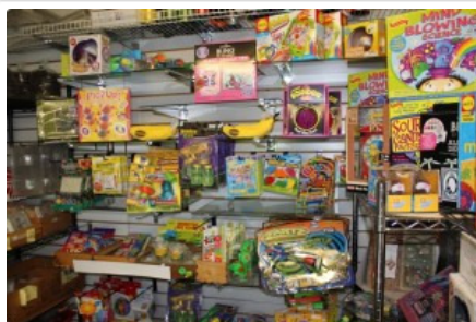
It's a toy store too!

She is adventurous and experiments with all kinds of concoctions that include ingredients such as chocolate covered popcorn, pretzels, caramels, brownies, nuts, nougat and peanut butter. Her marzipan fruits are really good too! Lisa is a fast learner and she pays close attention to conversations with her young customers and parents that come in for sweets. She rounded out the store with good popular toys and games. With her finger on the pulse of the kids she knows exactly what to buy.